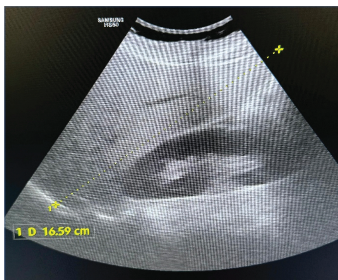
[Table/Fig-2a]: The yellow dotted line shows the extent of enlarged liver of size 16.59 cm.