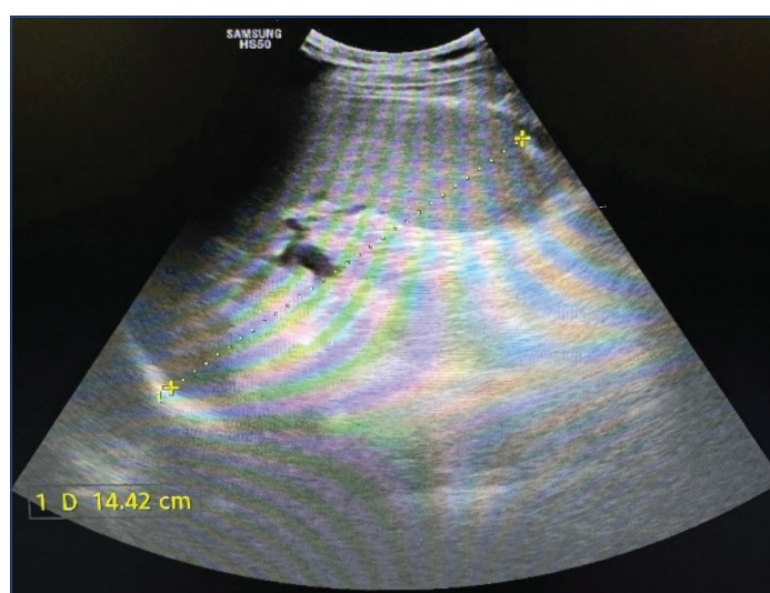
[Table/Fig-2b]: The yellow dotted line shows the extent of enlarged spleen of size 14.42 cm.

Based on the clinical presentation, laboratory findings and radiological imaging on Day 1, the patient was initially suspected to have fever with thrombocytopenia secondary to viral aetiology, along with obstructive jaundice. After the fever profile results came back negative, the